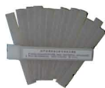
Abrasive paper tip