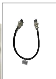
P-H cord & Test P-H cord