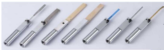
Collets and tips